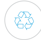
Battery Lifecycle Management